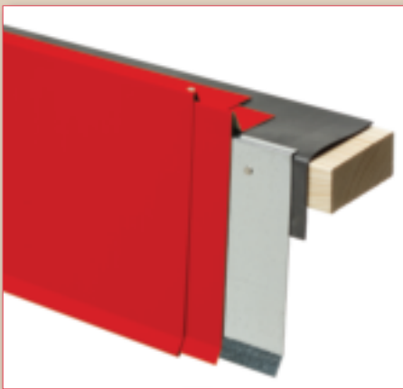
UNA-Edge™ GS Gravelstop System